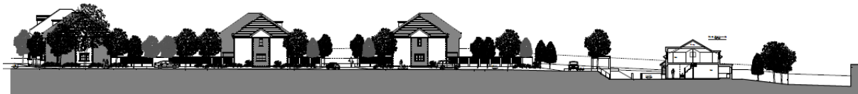
Zone B Flank Elevation H.9 > Gardens > Zone C Flank Elevation H.10 - H.15 > forecourts access > Flank Elevation H.16 - H.21 & down to Zone D H.22 - H.23