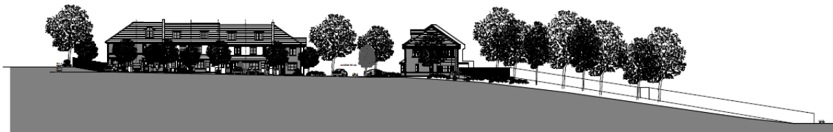
Zone B Elevations H.3 - H.9 > main centre access road > Zone E Flank Elevation H.32 & access road down to Aylesbury Road

A superseded plan has been published in the agenda. The current proposed site sections for consideration are shown below. These have been subject to consultation dated 29 June 2016).