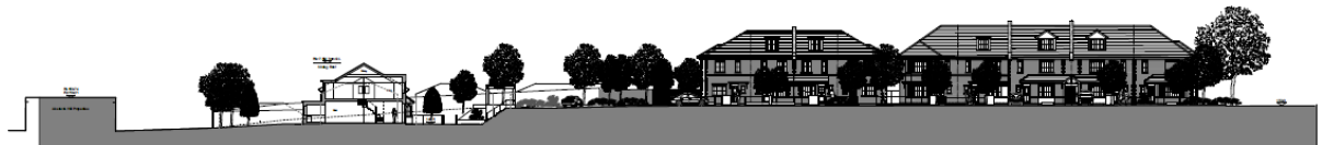
Abstacle Hill properties > gardens to Zone D H.22 - H.23 & access up to Zone E H.24 - H.27 & H.28 - H.32